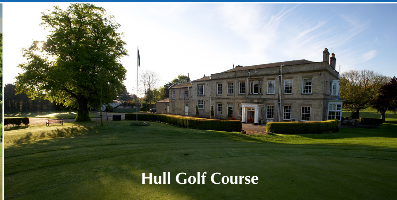
Hull Golf Course