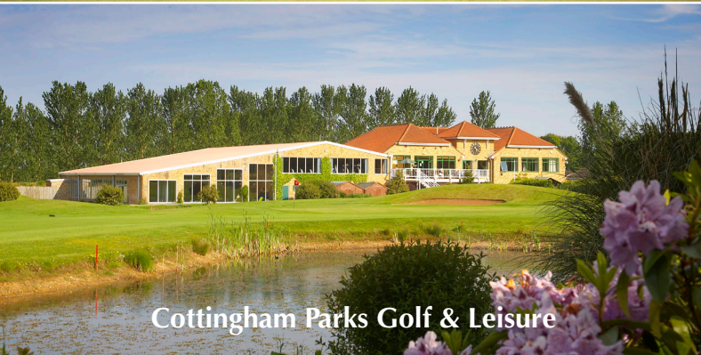
Cottingham Parks Golf & Leisure