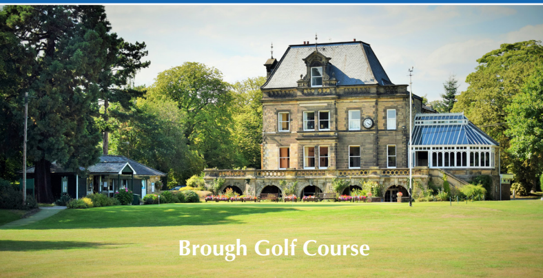
Brough Golf Course

Monday 17th to Friday 21st May 2021 4 Mixed Betterball Stableford Golf Events Over 4 Great Courses