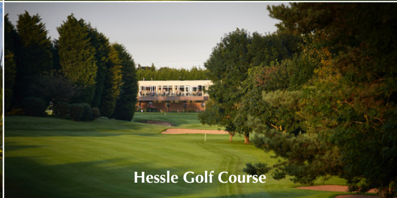
Hessle Golf Course